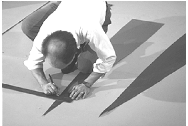
FIG. 1: CUTTING PANEL SHAPES FOR FORMING, USING CURVED-EDGE COMPOUND CURVE TEMPLATE.

Once the 90° legs are formed, the Compound Curved Tee-Panel must be curved by hand over the framework or substrate: The SL-1 does not curve the material.