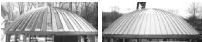
FIG. 2: COMPOUND CURVED TEE-PANELS FORMED WITH THE SL-1 HAVE CURVED EDGES AND ARE USED ON DOMES AND COMPOUND CURVED ROUNDED CORNERS.

THE BERRIDGE MODEL SL-1 PORTABLE ROLL FORMER is mounted on a heavy-duty four wheel cart and is completely self-contained, including uncoiler, mechanical shear and counter gauge for measuring panel length.